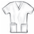
4700 V-neck Top XXS-5XL