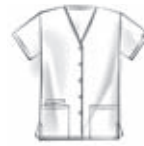
4770 Snap Front Top XS-5XL