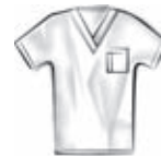
4777 V-neck Tunic XXS-5XL