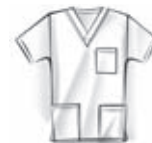
4876 Three Pocket Top XS-5XL