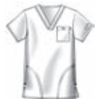
4780 V-neck Top XS-5XL