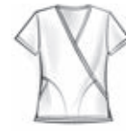
4800 Contrast Top XS-5XL Black binding unless noted