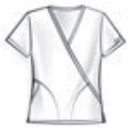
4880 Mock Wrap Top XS-5XL