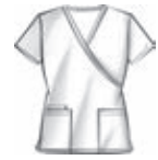
4801 Mock Wrap Tunic XS-5XL